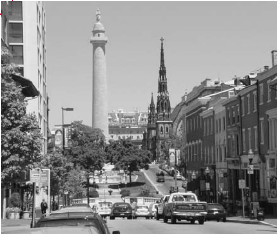
Mt. Vernon Historic District