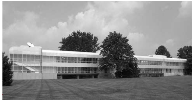
COMSAT Laboratories Building