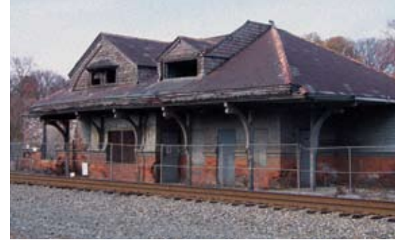
ABERDEEN B&O TRAIN STATION

In addition to those 43 sites on the growing Endangered Maryland list and 36 others which received grants from the Heritage Fund, Preservation Maryland played a part in protecting more than 20 other sites and communities. The variety ranged from the Anchors of Hope Cemetery , eroding on Hoopers Island, Dorchester County, to the protection of Belward Farm in Seneca, Montgomery County. Other advocacy efforts centered on the future of Maryland's former Rosewood Hospital Center in Baltimore County and helping to prevent the construction of a federal homeland security training center in Ruthsburg, Queen Anne's County. Work continued on the threat of a robotic parking garage adjacent to Preservation Maryland headquarters and resumed after progress was stalled on the redevelopment of the Superblock parcel of Baltimore City's historic West Side commercial district .