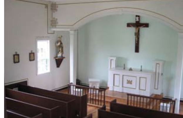
ST. PATRICK'S CATHOLIC CHURCH INTERIOR