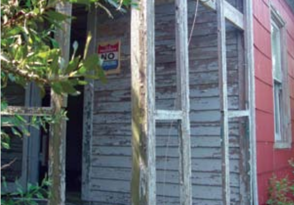
HIGH WINDS GUN CLUB