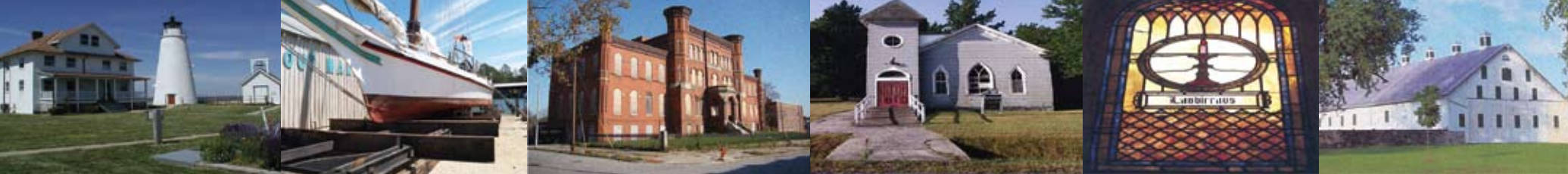
Cove Point Lighthouse, Dee of St. Mary's Skipjack, Hebrew Orphan's Asylum, Friends of Stanley Institute—Christ Rock U.M. Church, St. Paul's Church, and the Town of Williamsport.

Historical Society of Harford County, Inc., Bel Air, awarded $3,000 to assist with the cost of restoration of the exterior of the Hays House . One of the oldest surviving residences in Bel Air, the 1798 house is a museum.